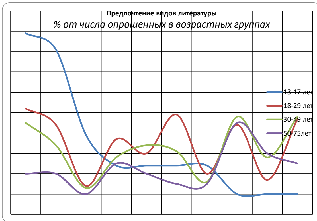
Literature preferences % from the amount of interviewed in age groups

Adventure stories, fantasy, mystery, comics, love novels, scientific literature, science-fiction, thrillers, detective stories, historical novels, memoirs, the biographies of famous people